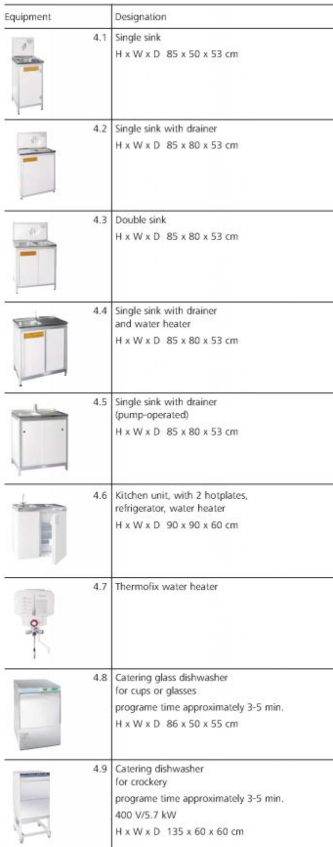
Illustration of rental equipment